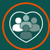
SEND and Inclusion