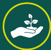
Teaching and Learning