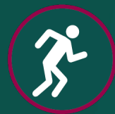
Sports and Enrichment