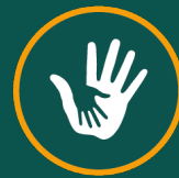
Parents and Carers