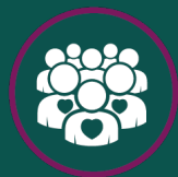
Pastoral and Welfare