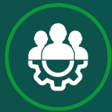
Leadership and Management

This framework highlights the importance we place on mental health and well-being across the College community. It embraces and is considered in everything we do. Find out more on our website.